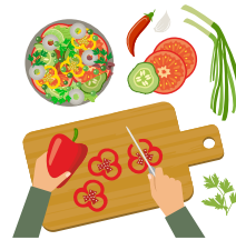
Cooking & Fire Safety